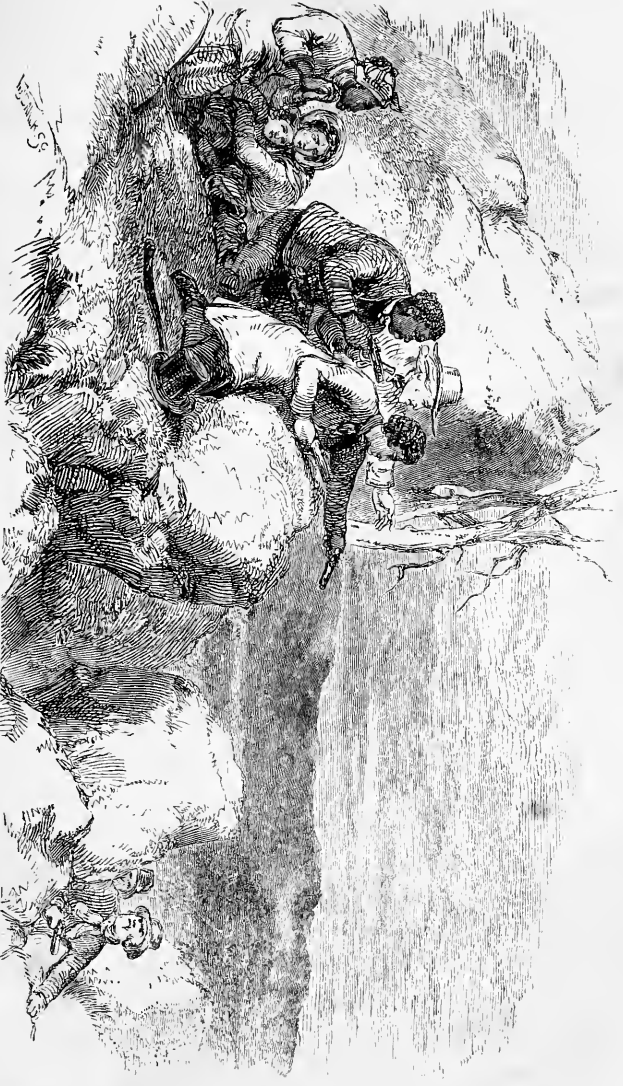
THE FREEMAN'S DEFENCE. Page 281.